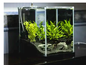
Polycarbonate automotive glazing Acrylic aquarium tank